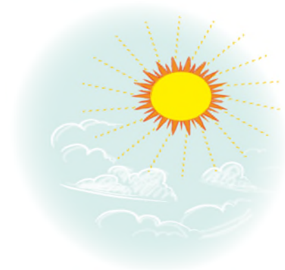
He will have to sit in the sun.