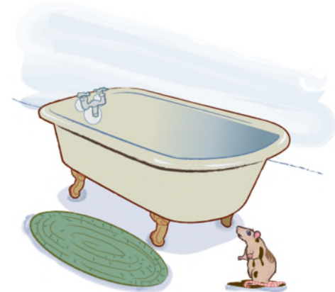
The tub is big. He can not get in.