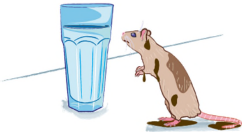
The cup is not a bath tub. He can not fit.