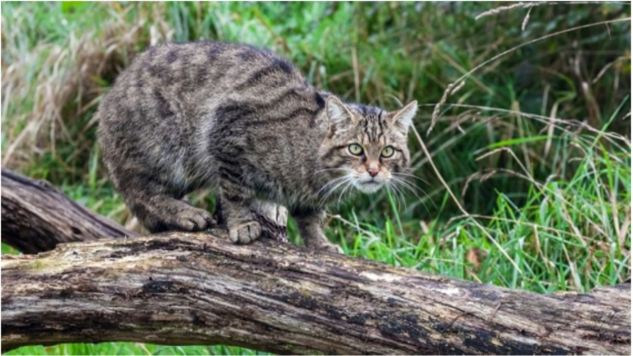
A cat is standing on a log.