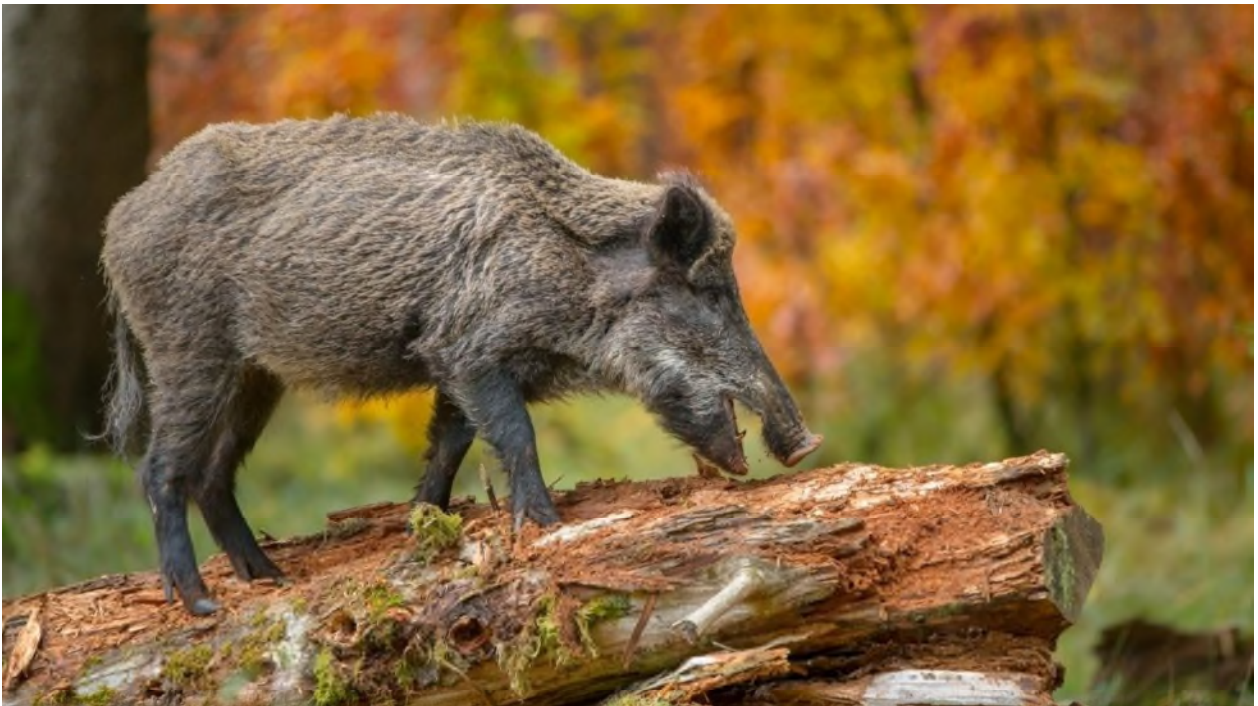
A hog is standing on a log.