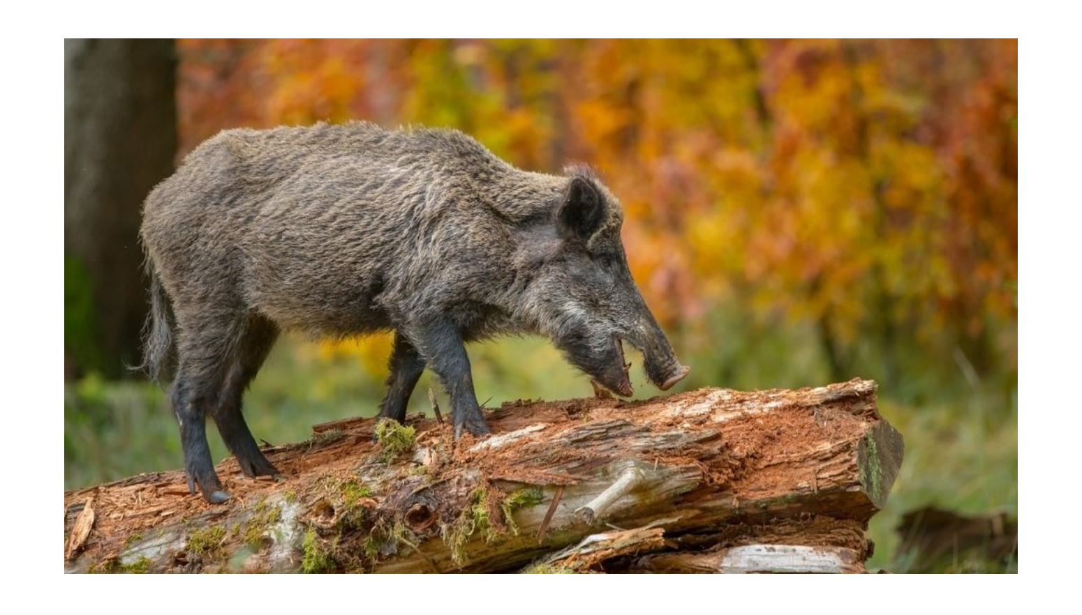
A hog is standing on a log.