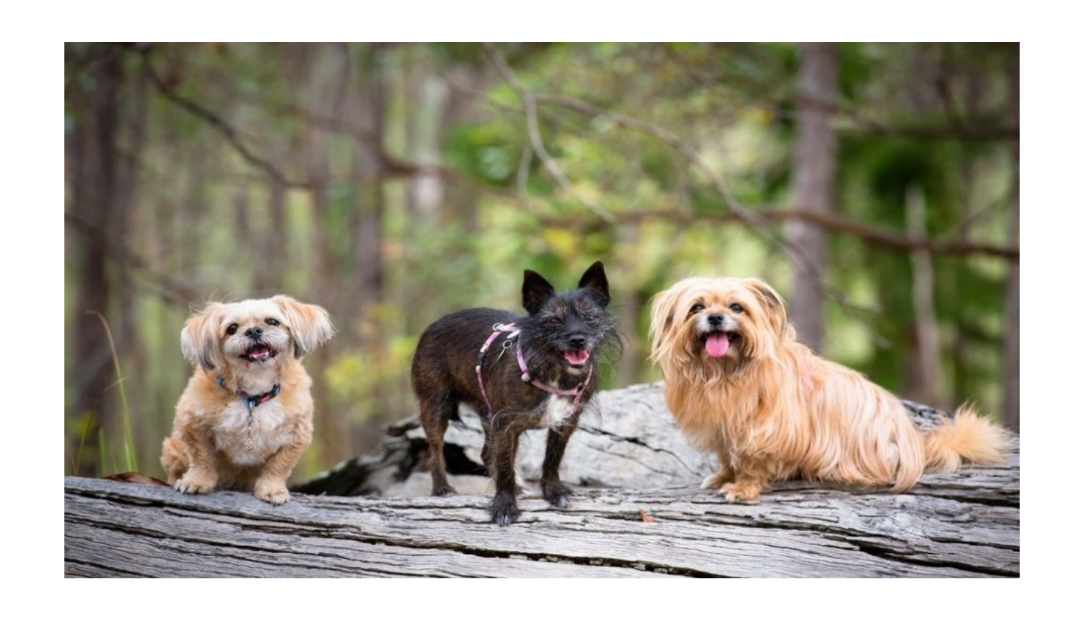
Three dogs are friends.