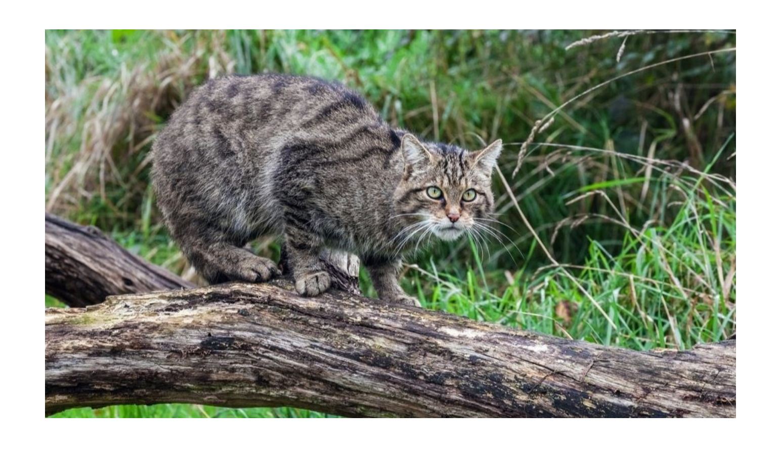
A cat is standing on a log.