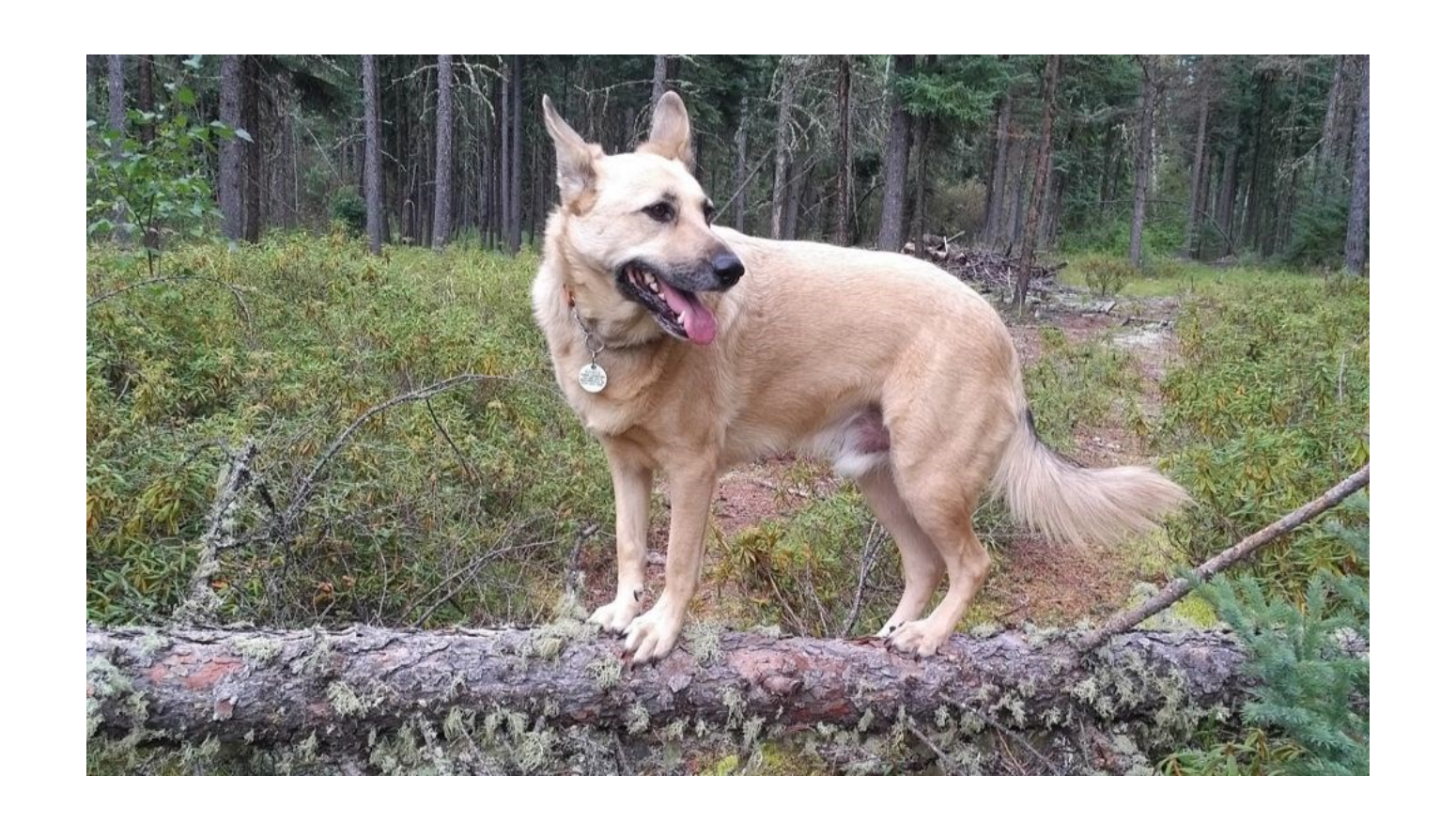
A dog is looking for a friend.